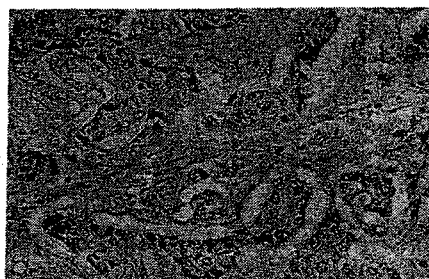
Fig. (1). Histology study. (a) A case of IDC by hematoxylin and eosin stain (X 400) showing mitosis.