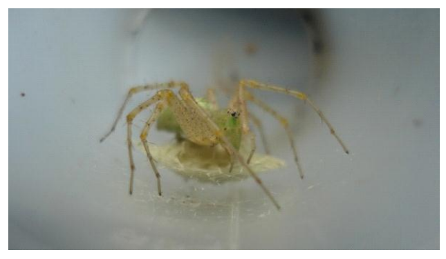
Figure (2): Adult female guarding the egg sac

The incubation period of eggs of P. arabica lasted 31 and 35 days for the first egg sac while the second one, the incubation period lasted after 20 and 25 days respectively.