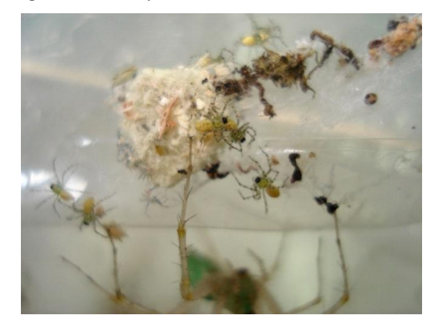
Figure (3): Spiderlings

From the previous egg sacs, 111 individuals hatched and emerged through a round pore at the tip of the egg sac (fig.3), they were reared under laboratory conditions. Only 41 of them reached maturity and completed the life cycle.