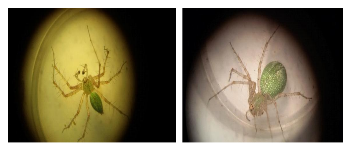
Figure (4): Adult Male and Female