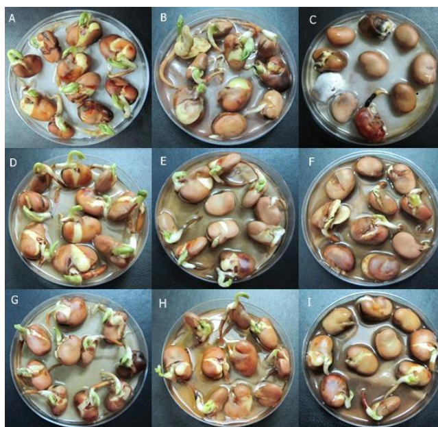
Figure 3: Effect of AgNPs on faba bean seed germination after 10 days. A; Control (water), B; 1mM AgNO 3 , C; Fusarium oxysporum spore suspension (SS), AgNPs concentrations, D; 0.12mM, E; 0.25mM, F; 0.5mM, G; SS + 0.12mM AgNPs, (H) SS + 0.25mM AgNPs, and (I) SS + 0.5mM AgNPs

In case of faba bean, concentrations of AgNPs at 0.12mM and 0.25mM alone or in combination with the Fusarium spore suspension did not show any significant differences in seed germination percentage, diseases incidence (rot seeds), and vigour index compared the control or 1mM AgNO 3 . AgNPs at concentration of 0.25 mM significantly reduced the shoot length Fig. (3) and (Table 3). The concentration of 0.5mM of AgNPs alone or in combination with Fusarium spore suspension significantly reduced germination percentage by 60 and 70%, and vigour index value by 72 and 97.3, respectively compared with the control (water), 1mM AgNO 3 or Fusarium infection. Whereas, the P value less than 0.05 was considered significant. Furthermore, it was observed that the roots became colored with brown dark regions as result to AgNPs treatments. Treatment with seed borne pathogen Fusarium caused a reduction in faba bean seed germination as it reached 20%. The disease incidence of Fusarium infection recorded as rotted-seeds was 50%. But, incidence of Fusarium infection was reduced when the faba bean seeds treated with any of AgNPs concentration to record 5%. Faba bean seeds treated with low concentration of AgNPs showed a great impact on germination and reduced the disease incidence.