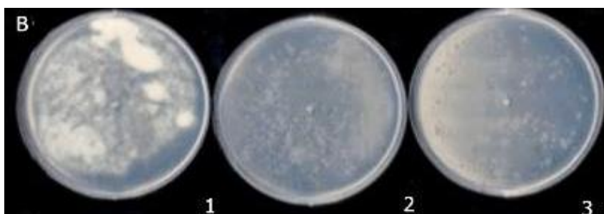
Figure-1: Antifungal activity of biosynthesis silver nanoparticles against colonies formation of Fusarium oxysporum . (1) Control, (2) AgNO 3 , (3) Silver NPs mixed with F. oxysporum spores for 24 h.

Silvers nanoparticles possess different properties, which might come from morphological, structural and physiological changes (Nel et al. , 2003). Silver nanoparticles are highly reactive as they generate Ag + ions while metallic silver is relatively unreactive (Morones et al. , 2005). Also, the nanoparticles efficiently penetrate into microbial cell, which implies lower concentrations of nano-sized silvers sufficient for microbial control. A previous study indicates that silver nanoparticles disrupt transport systems including ion efflux (Morones et al. , 2005). Also, silver ions are known to produce active oxygen species (ROS) via their reaction with oxygen, causing damage to cells proteins, lipids, and nucleic acids (Storz & Imlay, 1999 and Hwang et al. , 2008).