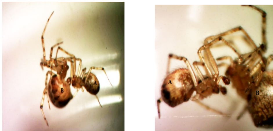
Fig. (2): Theridion spinitarse O. Pickard-Cambridge adult, A (Male) and B (Female).